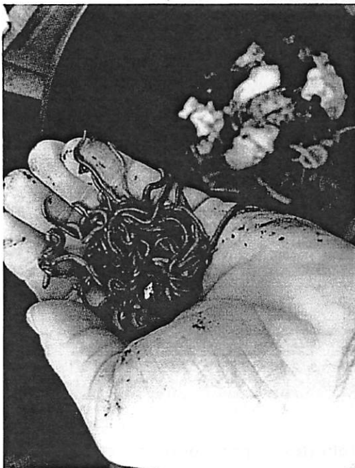
Worms from Don Campbell's compost bin